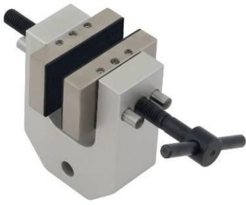
TH240k Small vice grip