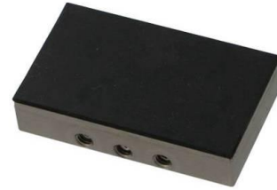
TH240k-BG jaws Rubber-coated jaws